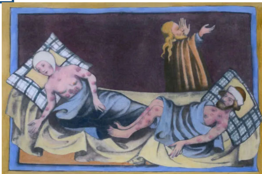
Figure 2. Untitled medieval painting, by unknown author, on a 1411 Bible from Toggenburg, Switzerland, written in German, portraying a man and woman with the bubonic form of the Black Death and its characteristic buboes spread on their bodies.

The presence of a man, with blond hair and beard, in the background of the painting, seems to allude to the sacred. His garment can indicate he is a cleric, an inference supported by the fact that it bears the color blue, at that time a shade associated with nobility, i.e. a higher social status. Historically, society at that time was organized into different social strata, and both the high and low clergy held prominent positions at the top of this social hierarchy. Analyzing his arms outstretched toward the sky, it is plausible to conclude that he is engaged in an act of prayer, turning to God in supplication for the sick couple's salvation, a common religious practice back then.